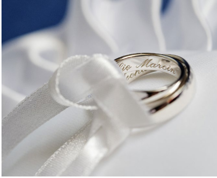
Personalising and engraving jewellery