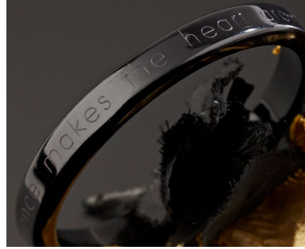
Personalising and engraving jewellery