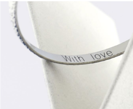
Personalising and engraving jewellery