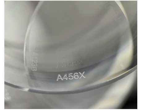
Marking on labels