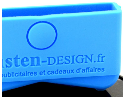
Non-contrasted marking on plastics