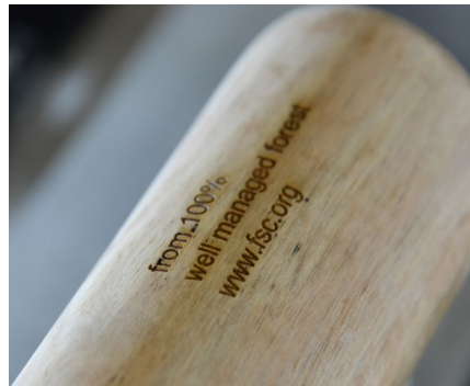
Marking on wood