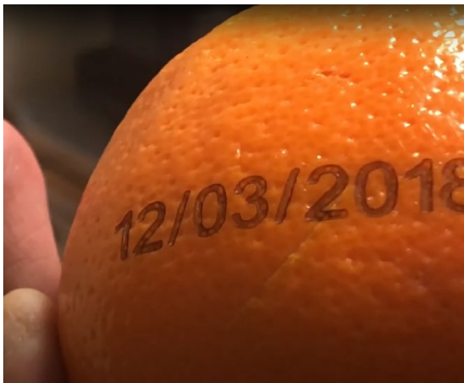
Fruits & vegetables marking