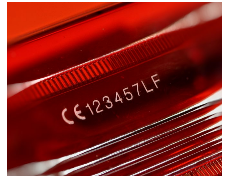
Glass & transparent plastics